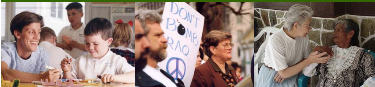
SMITHSONIAN MUSEUM - S. DILLON RIPLEY CENTER WASHINGTON, D.C.

A traveling exhibit showcasing the extraordinary contributions of women religious to this country's social and cultural landscape