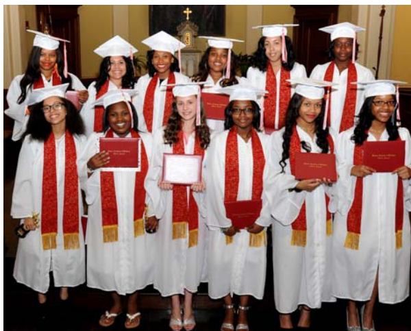
Sisters Academy of Baltimore graduates