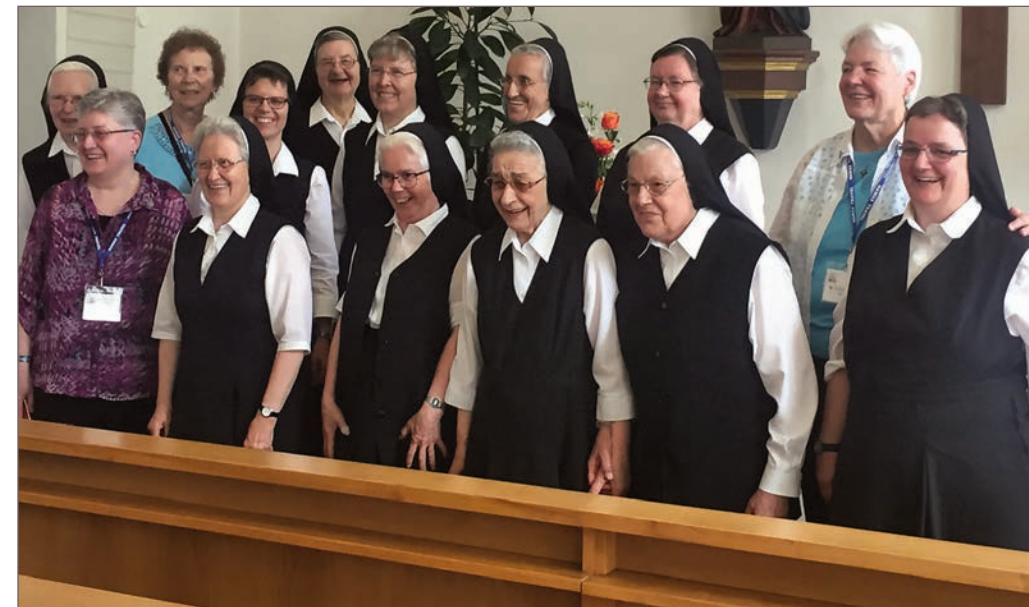
Sisters from the Atlantic-Midwest Province joyfully shared a photo with Sisters from the Bavarian province during the Heritage Pilgrimage.