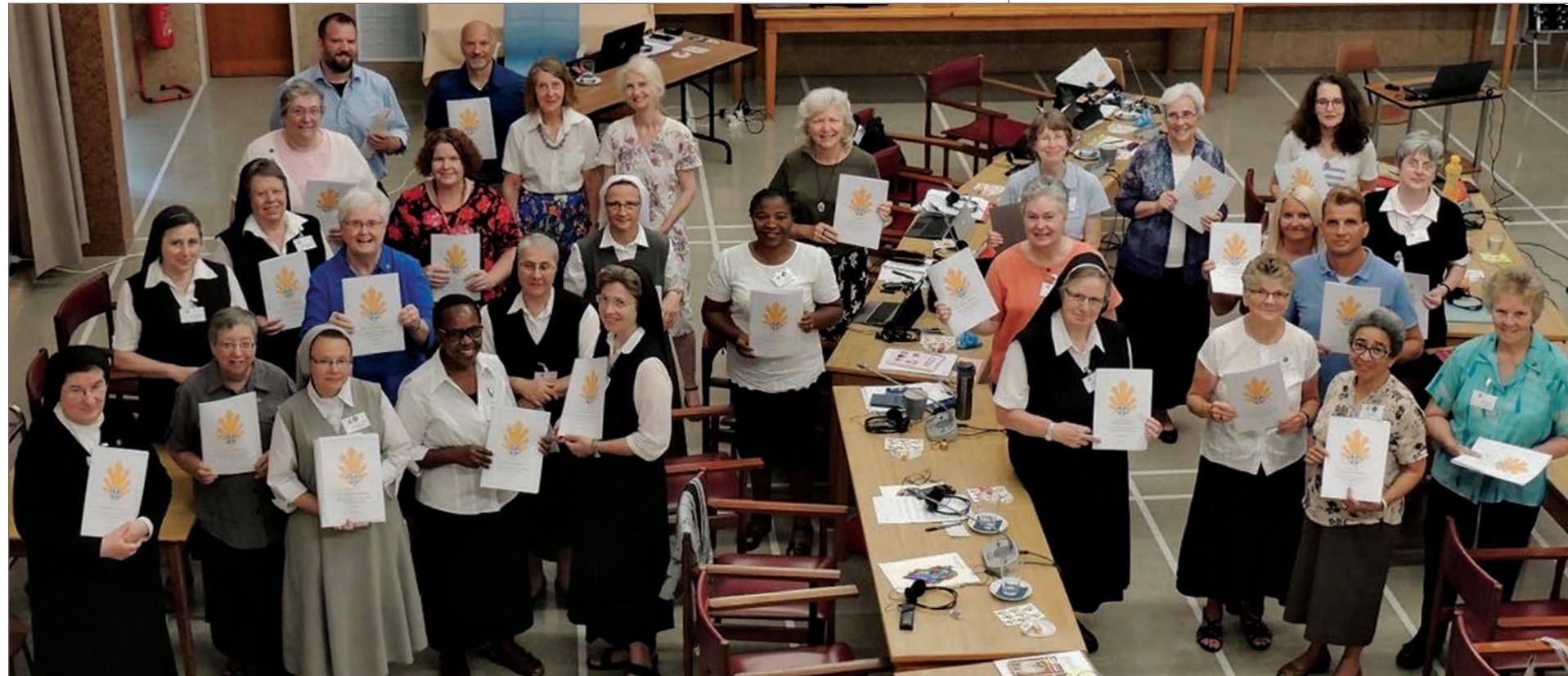
The international members of the CCTT show off the Congregational Communications Plan that they discussed during an August meeting in Rome.