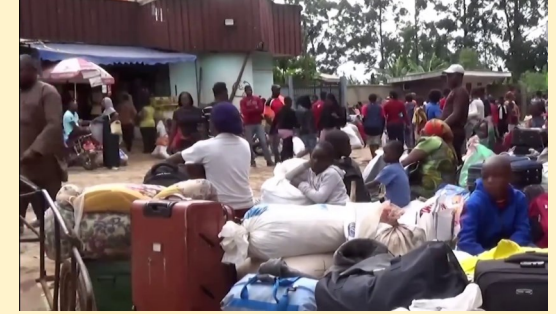
Internally Displaced Persons in Douala

Story: This story is about "Danielle," whose name is changed due to her sensitive and pending asylum