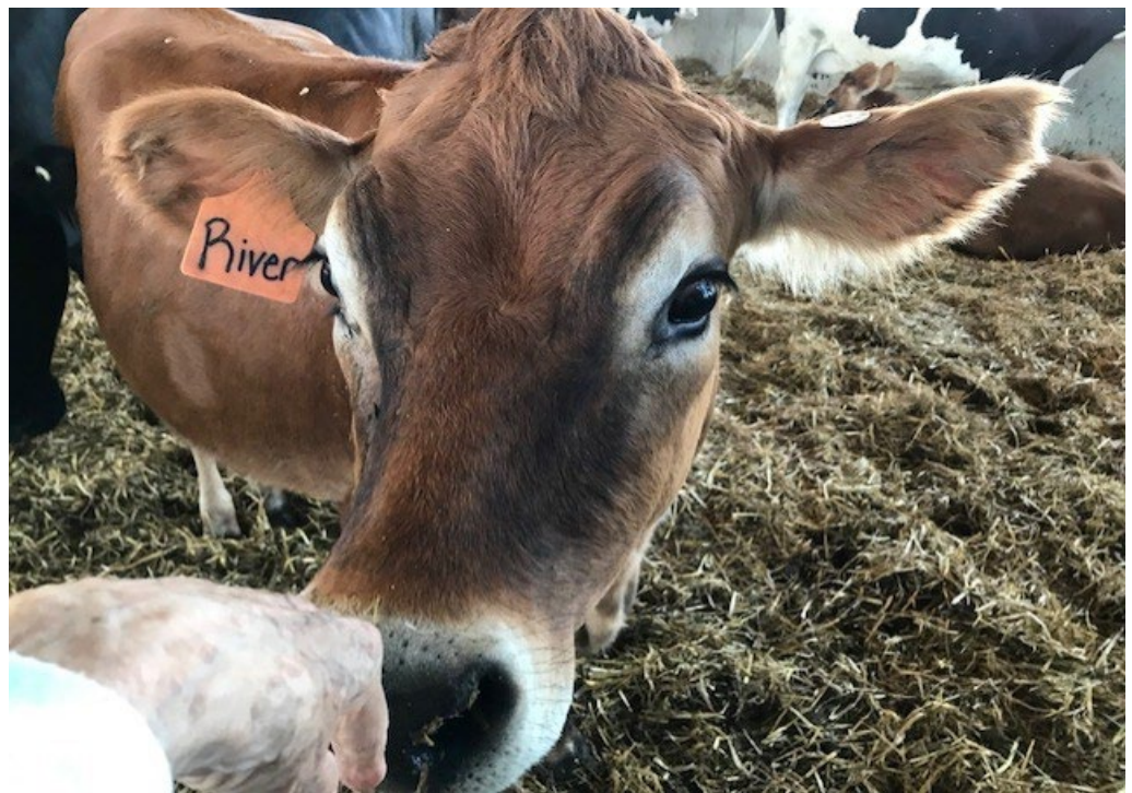
A Heifer licking salt.