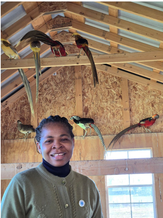
Immaculata in the pheasant barn, enjoying their activities of flying and their colors.