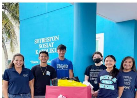
Donation of goods to Alee Shelter. (Guam)