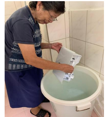
Recycling water from the dehumidifier