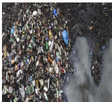
Reduce the waste we produce (Guam)