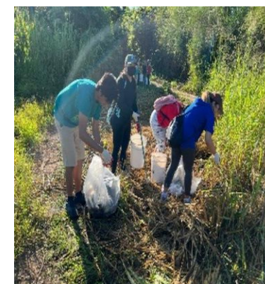
Students at our sponsored NDHS collaborate or /and initiate activities align with Shalom