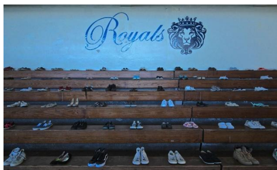
Hundreds of shoes in remembrance of Holocaust victims.