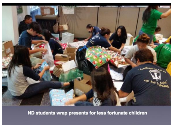
ND students wrap presents for less fortunate children