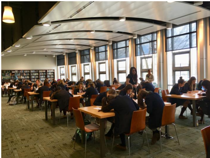
AHA students writing awareness letters

A school tradition and a national event converged March 14th at the Academy of the Holy Angels, where the Awareness Day theme of “Seeking Unity in a Diverse World” dovetailed with student actions in solidarity with the survivors of the February 14th shooting at Marjory Stoneman Douglas High School in Parkland, Florida.