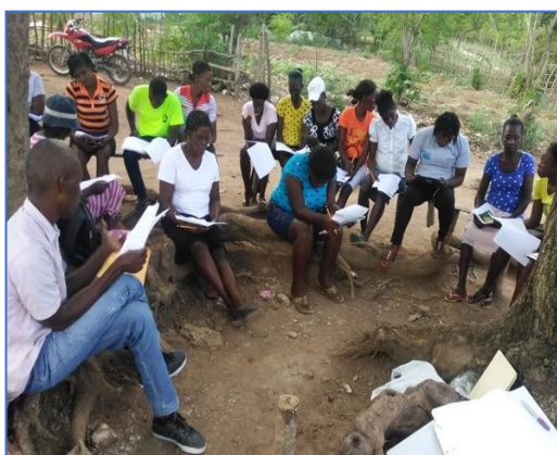
Prior to receiving installation of a rainwater catchment system, a family garden participant is required to attend a workshop on how to plant and care for an organic vegetable garden at home. Women heads of household from across La Gonâve Island gathered for these workshops.

“You visit the earth and water it, make it abundantly fertile. God’s stream is filled with water; with it you supply the world with grain. Thus do you prepare the earth: you drench plowed furrows, and level their ridges. With showers you keep the ground soft, blessing its young sprouts. You adorn the year with your bounty; your paths drip with fruitful rain. The untilled meadows also drip; the hills are robed with joy.” - Psalm 65