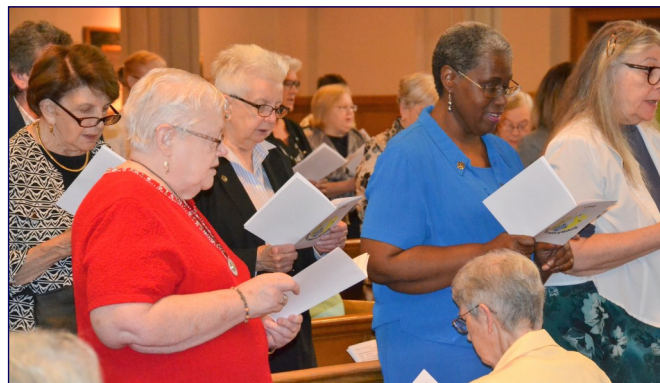
Associates stand and renew their covenants in the chapel of Villa Assumpta.

Sister Jean shared so many experiences and stories with us that we left the day of laughter and reflections with a treasure of grace filled memories. A lasting thought was this question, "Do we want to be Provolone cheese or Swiss cheese?" Provolone cheese is complete and full of itself and has no room for anything