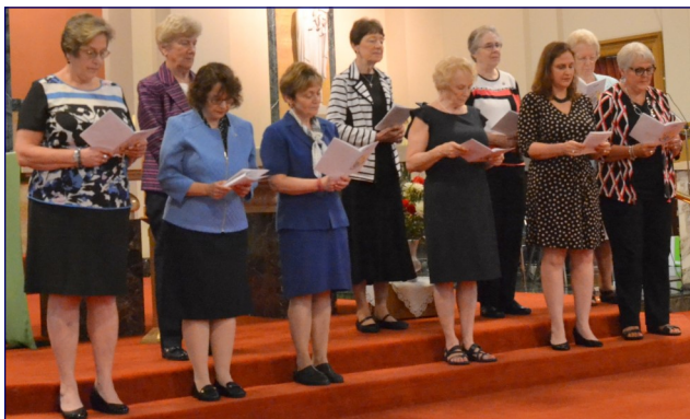
Baltimore Pre-Associates make their first covenant, accompanied by their companions.