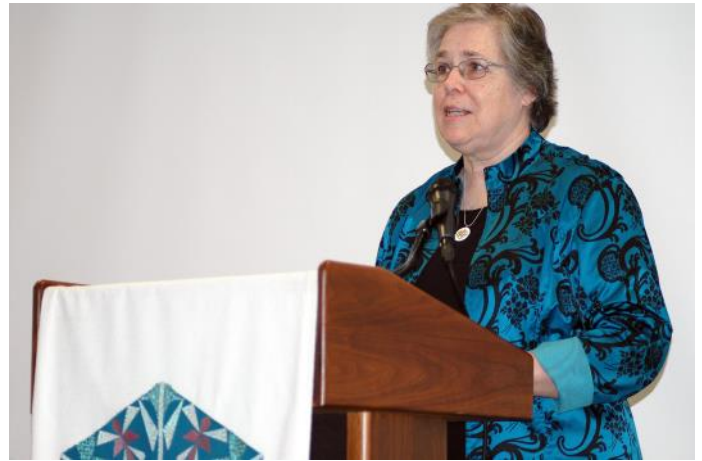
presented to the Baltimore Area associates on February 27 th . Consider inviting her to speak at one of your events during the upcoming year.