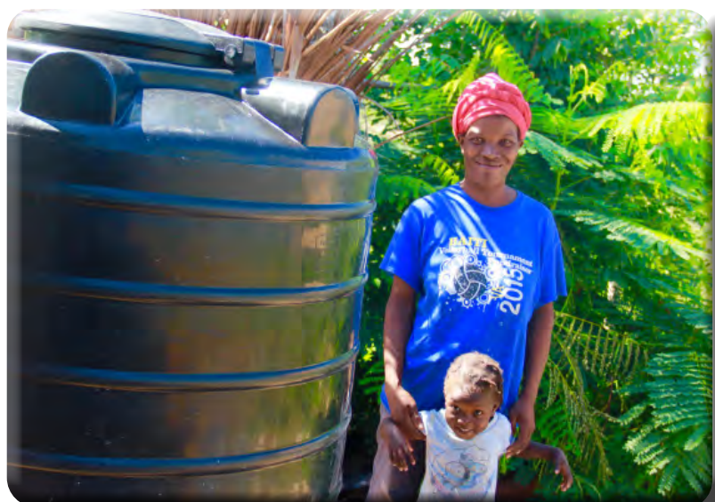
Enjoying the gift of safe water

bottled water and straws, and other plastics that pollute the earth's water and threaten the life that is dependent on it.