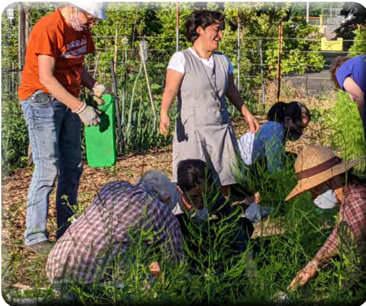
Gardeners at work

While gardeners may start out growing tomatoes, fruits and vegetables, they end up growing something a lot bigger, they grow a community.