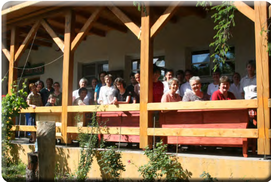
Sisters gathered at Aviary Community Center