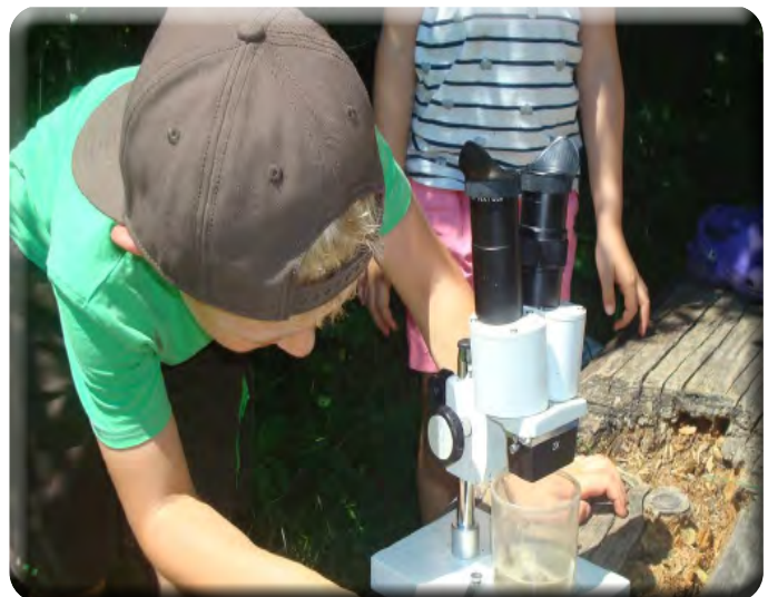
Exploring what lives in our water

Throughout the year, we consciously observed the changes in nature with the children. Our children have learned many things. They learned how nature can help itself and what alternatives there are to chemical pest control in the garden. They found out what it means to plant something and take responsibility for it. They learned how we can live in an environmentally sustainable world. We all learned that together we can stay healthy, discover and protect Earth.