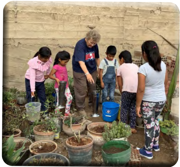
In promoting the values of Shalom the children water and care for the plants in our garden.

Lately we talked about the apostolic exhortation, Querida Amazonia , where Pope Francis names his four dreams for the earth (honor the rights of the poor, preserve its distinctive culture, preserve its natural beauty, and give the Church community new faces with Amazonian features). These dreams give the children a greater sense of their unique identity and responsibility to care for their home.