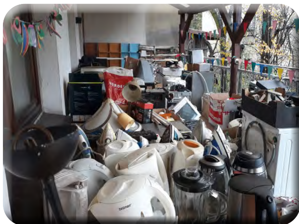
Two tons of electronic and electrical waste

Text and Photo: Sister M. Chiara Burzyńska (PO, Poland)