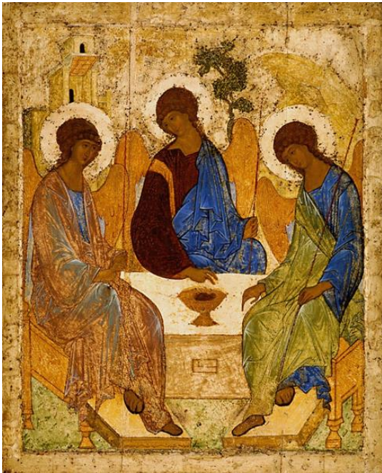
“The Trinity” by Andrei Rublev

Prayer Leader: “May God the Father care for you all and keep you steadfast and faithful in your holy vocation!”