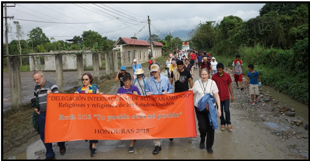
Emergency international religious delegation accompanying Honduran citizens at a peaceful demonstration

The systematic violation of human rights, persecution of leaders, cruel and inhumane treatment of detainees, illegal imprisonments and arbitrary detentions, and criminalization of the act of public protest has been sharply denounced by international human rights organizations including the United Nations High Commissioner for Human Rights and the Inter-American Commission on Human Rights.