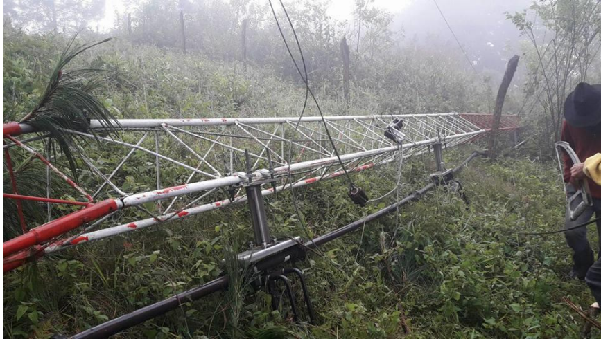
Downed Transmission Tower for Radio Progreso

region in the department (state) of Francisco Morazán. Interestingly, the sabotage took place directly after a surprise visit to Radio Progreso's offices in Tegucigalpa by employees of CONATEL, the national communications regulatory entity, who demanded to be given the precise location of the transmission towers.