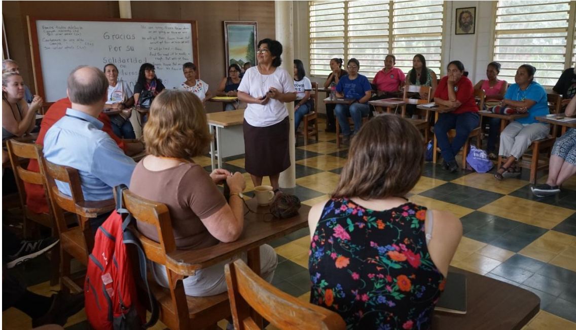
Figure 1 Visitors to the Notre Dame Bilingual School