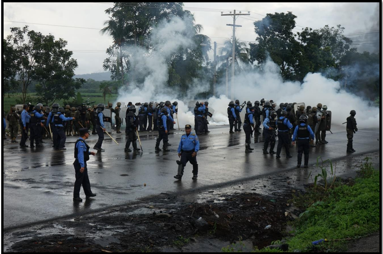
Honduran Police Attacking Peaceful Protestors with Tear Gas, January 27, 2018

The church, entrusted with the earth's glory, believes that in each person is the Creator's image ... Whoever tortures a human being, whoever abuses a human being, whoever outrages a human being abuses God's image, and the church takes as its own that cross, that martyrdom."