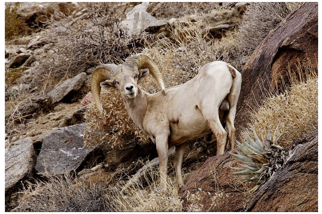
Endangered bighorn sheep