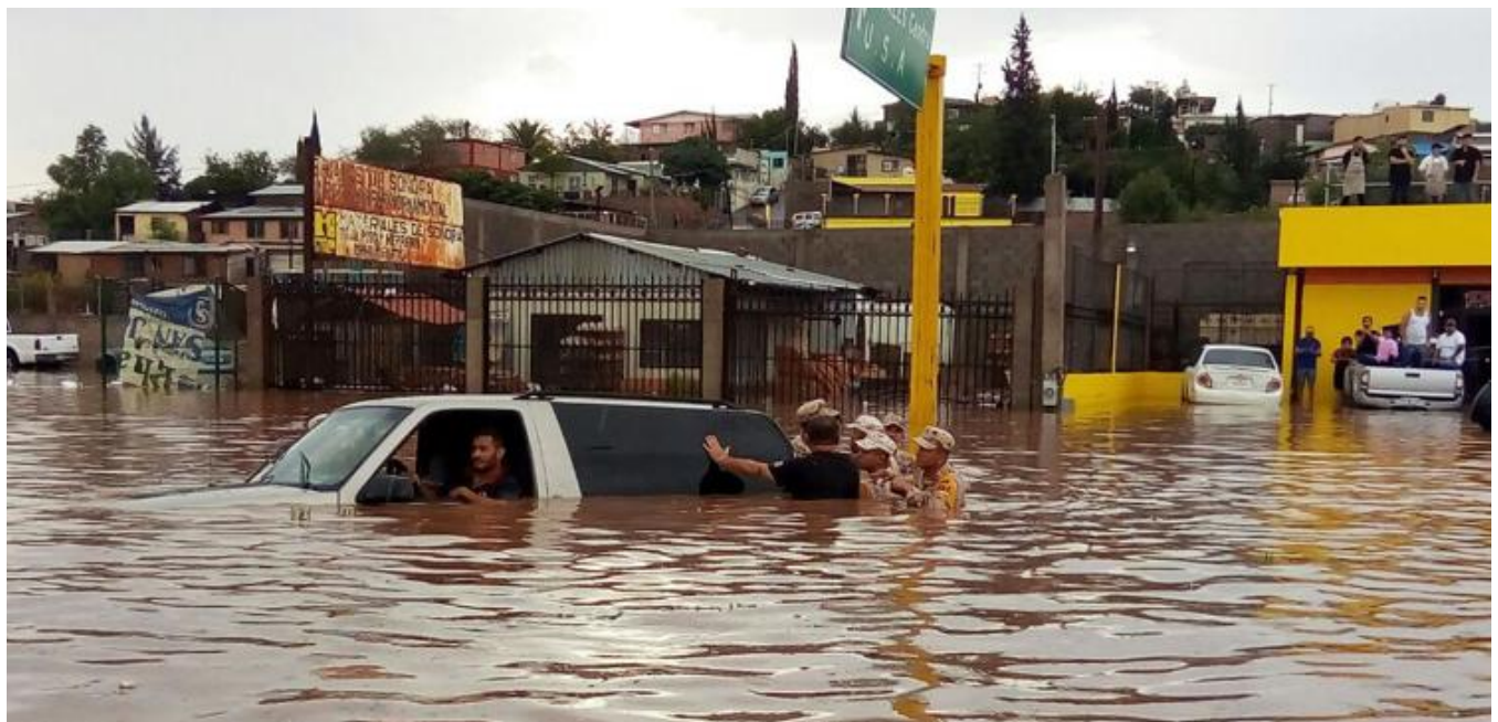
Flooding in August, 2018 in Nogales, Sonora

All: God of Justice, we know that you are present with those suffering from floods and fire (Isaiah 43). May we see the world through your eyes and act “so that our planet might be what you desired when you created it, and correspond with your plan for peace, beauty and fullness” ( Laudato Si' , 53).