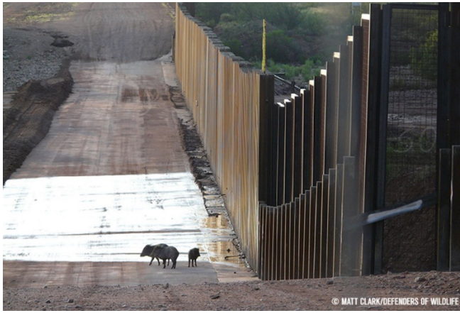
A family of javelinas encounters the wall