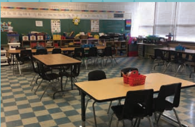
The children’s classroom at Corazón.

By giving these underserved persons a place to feel welcomed, safe and empowered, each of these ministries is walking in the footsteps of Blessed Theresa by continuing her mission to transform lives through education.