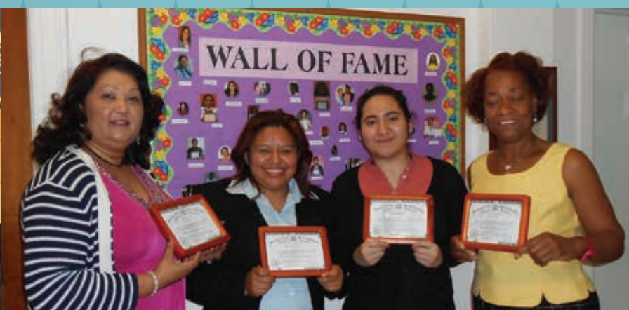
Graduates of the SSND Educational Center gather in front of the Wall of Fame, where they will soon be featured.