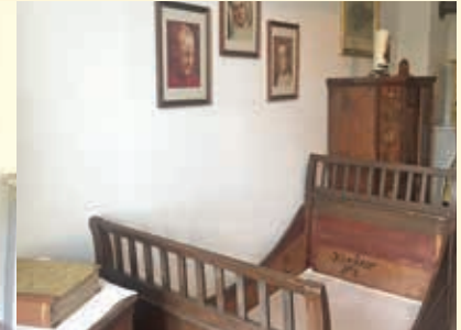
Mother Theresa's bedroom in Germany (Bavaria) looks just as it did when she was alive, thanks to the Sisters who faithfully preserve it.

For two centuries, the School Sisters of Notre Dame (SSND) have answered the call to service, responding to the most urgent needs of the times, not only in North America, but also around the world. They are professors, teachers, administrators and counselors; they are librarians and spiritual directors; they are nurses, facilitators, artists and therapists; they are justice and peace promoters, pastoral ministers, volunteers and women of prayer. Regardless of how they serve, the sisters educate in all that they do, bringing a spirit of hope to their realities.