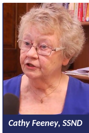
cutily reeliey, 55ivi

The keynote address confirmed my convictions that sponsorship is a unique way to continue the legacy of our foundress. Throughout the conference, I was encouraged by the interaction among marvelous lay leaders. They are the prophets of the future.