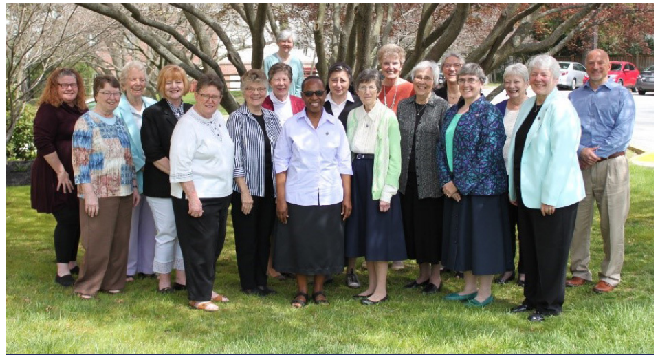
General Council, AM Council and AM province directors April 13, 2022.

Since the last issue, we not only celebrated Easter but lived through an entire Easter Season. Scripture recounts for us Jesus' many appearances to people he was close to during his lifetime. We heard accounts of Jesus appearing first to Mary Magdalene at the tomb, then to the other women as they return from the tomb, to Simon Peter, to the disciples on the road to Emmaus, and later the disciples in the upper room - first without, then with Thomas, to the seven disciples at work, fishing at the Sea of Tiberius. He appeared to the 11 disciples at an appointed place on a mountain in Galilee, where Jesus gives the "Great Commission". Jesus appeared to 500 brethren at once and was seen by his brother James. He was seen ascending into Heaven by the apostles and others, but