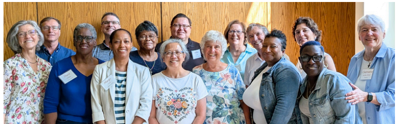
Claiming the Fire Within Retreat, June 2025

As summertime reaches its peak , we find ourselves surrounded by the fullness of creation—fields ripe with grain, gardens and farmers markets brimming with fruits and vegetables, and hearts stirred by the beauty of colors, scents, and growth. In this season of abundance, the Office of Mission Formation celebrates a different kind of harvest: the vibrant, life-giving and impactful outcomes of programs and resources offered through the office and our sponsored and co-sponsored ministries.