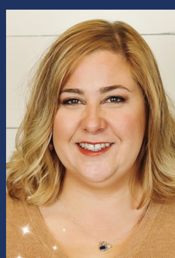
HOPE has been the theme of our communications ...